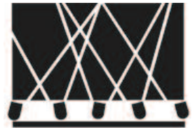
Oconto Falls Friends of the Arts